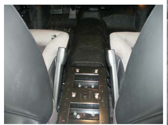
View of partial OEM console removed